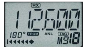
CDI mode display

The IC-A24 has VOR navigation functions. The DVOR mode shows the radial to or from a VOR station and the CDI mode shows the course deviation to/from a VOR station. You can also input your intended radial to/from the VOR station and show the course deviation on the display. In the USA version, the duplex operation allows you to call a COM channel, while you are using VOR navigation. (* IC-A24 only)